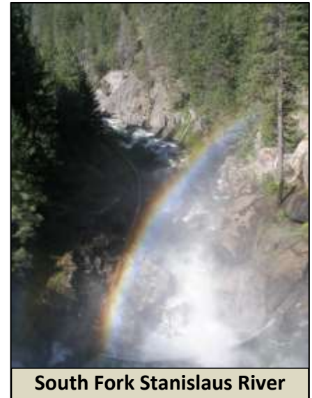
South Fork Stanislaus River

In order to ensure that tap water is safe to drink, the U.S. Environmental Protection Agency (U.S. EPA) and the State Water Resources Control Board (State Board) prescribe regulations that limit the amount of certain contaminants in water provided by public water systems. State Board regulations also establish limits for contaminants in bottled water that must provide the same protection for public health. Drinking water, including bottled water, may reasonably be expected to contain small amounts of some contaminants. The presence of contaminants does not necessarily indicate that water poses a health risk.