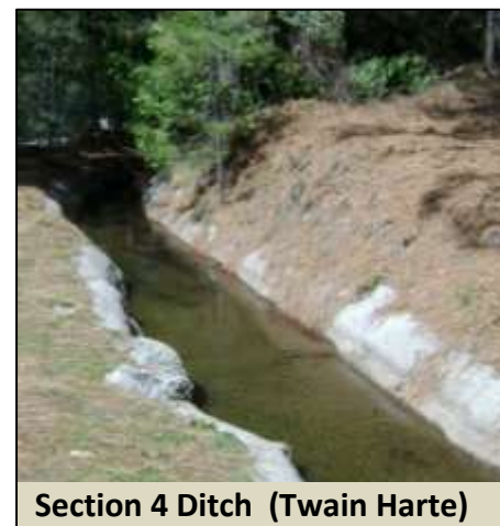
Section 4 Ditch (Twain Harte)

Over the last several years, we have also constructed three grant-funded groundwater wells, which are used regularly to supplement the surface water supply and provide greater water reliability to the community.