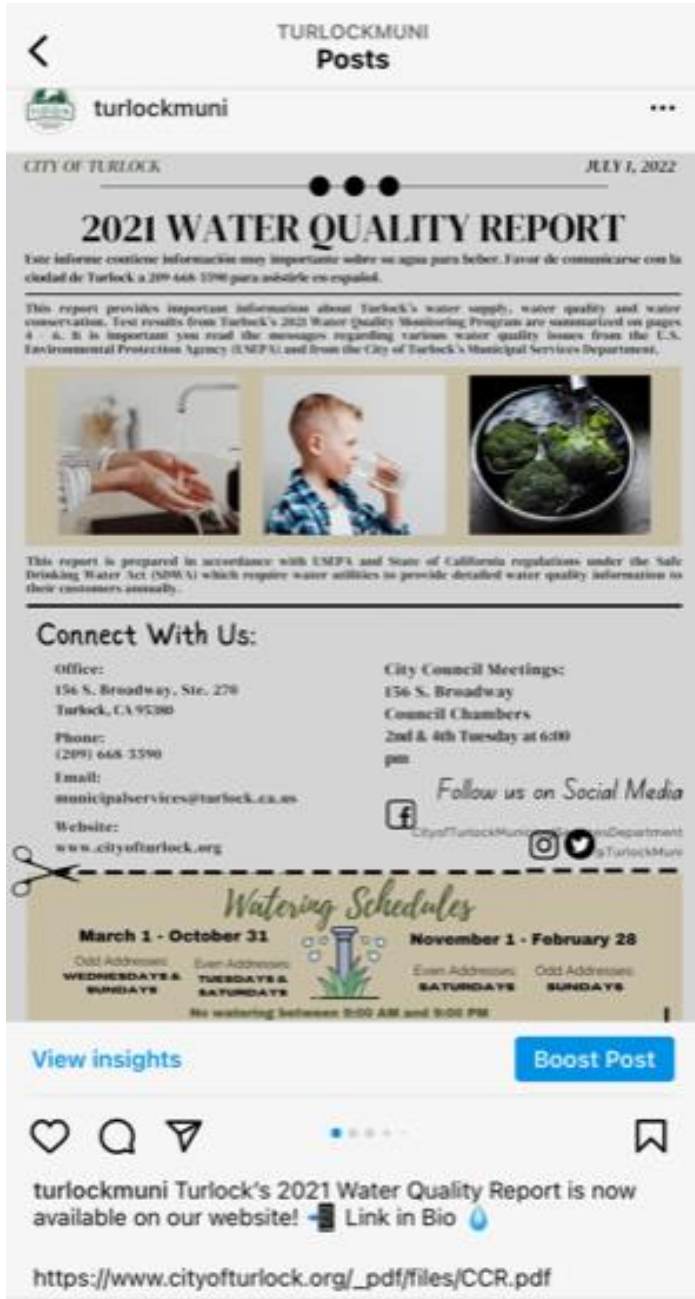
Instagram @TurlockMuni 6-27-2022