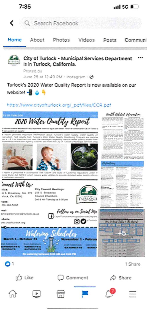
FaceBook CityofTurlockMunicipalServices 6-25-21