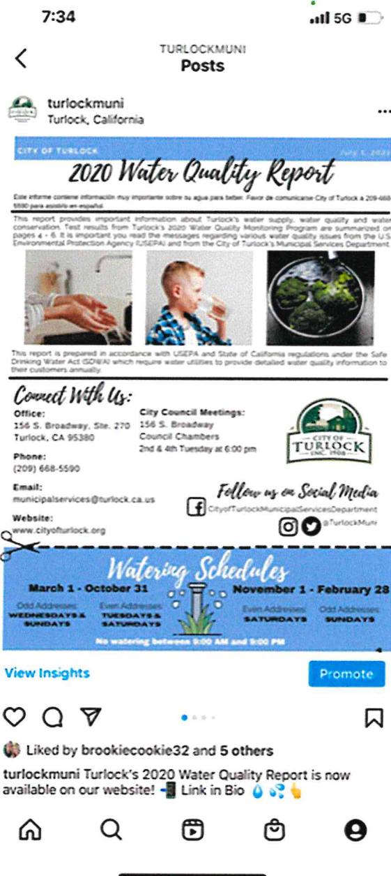
Instagram @TurlockMuni 6-25-21