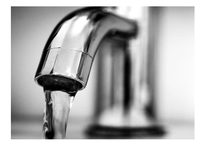
The sources of drinking water (both tap water and bottled water) include rivers, lakes, streams, ponds, reservoirs, springs and wells. As water travels over the surface of the land or through the ground, it dissolves naturally occurring minerals and, in some cases, radioactive material, and can pick up

Este informe contiente información muy importante sobre su agua de beber. Tradúzcalo ó hable con alguien que lo entienda bien.