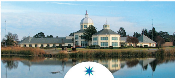
SUISUN-SOLANO WATER AUTHORITY

Este informe contiene información muy importante sobre su agua potable. Tradúzcalo ó hable con alguien que lo entienda bien.