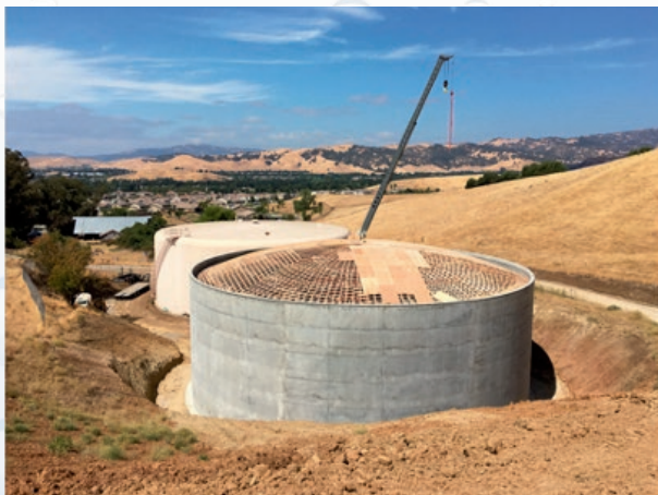
NEW Tank 2B allows for MANY flexible options!

All of the projects were necessary to help staff continue to provide quality water and accurately measure usage.