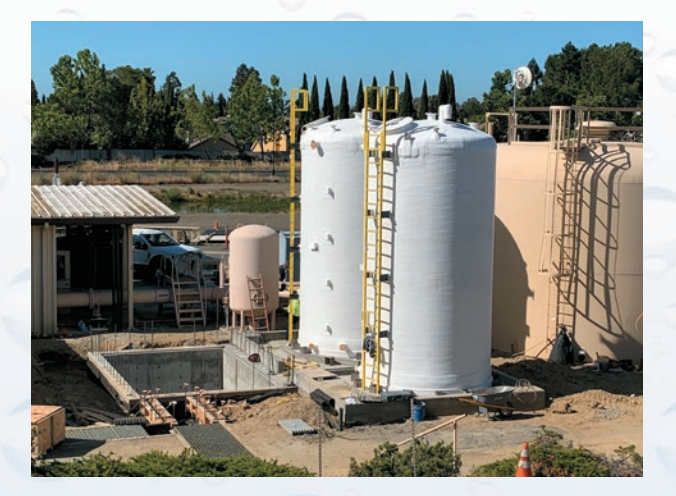
Figure 1 New Sodium Hypochlorite Tanks

The project is currently underway and is expected to be completed in the Fall of 2022. This project will improve aging infrastructure and ensure continued reliable long-term operations in water delivery to the Suisun-Solano Water Authority service areas.