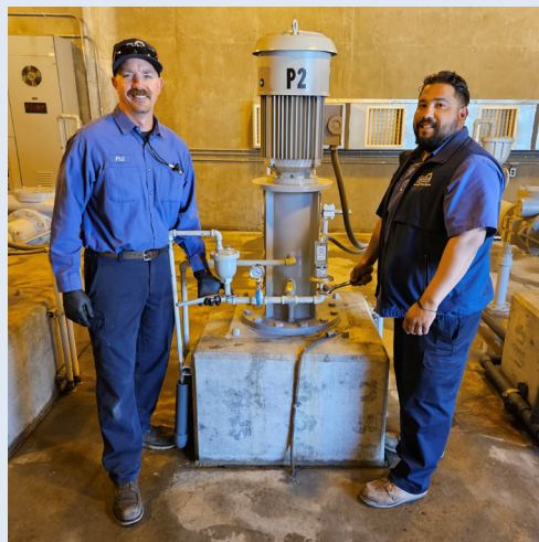
Far Left: A Muni Water main replacement project as part of a capital improvement project to improve aging infrastructure.