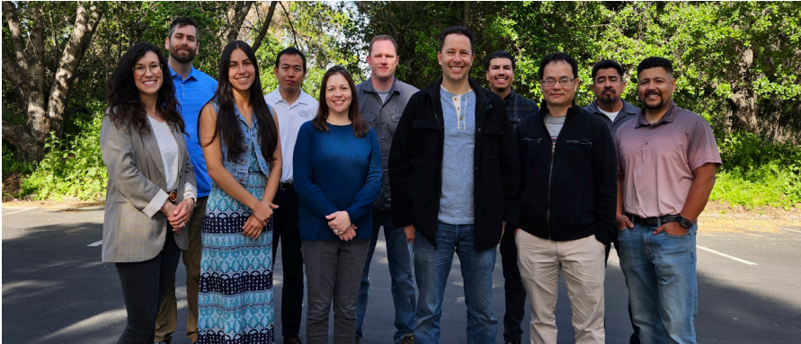
San José Municipal Water System engineering, inspection, water efficiency, and recycled water staff.

For water-efficiency tips or to view the complete list of water use rules in effect at all times, please visit www.SJEnvironment.org/WaterEfficiency or call 408-794-6784. Keep up the great work!