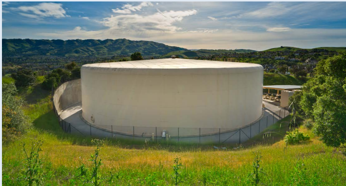
Toulon Pump Station and Reservoir, provides water to a portion of the Evergreen service area.

♻️ Printed on recycled paper using soy-based inks. 0620/Q400 /1061/EGAD/IX/VL