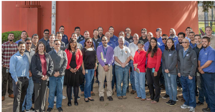
San José Municipal Water System engineering, inspection and water efficiency staff.

For water-efficiency tips or to view the complete list of water use rules in effect at all times, please visit www.sjenvironment.org/waterefficiency .