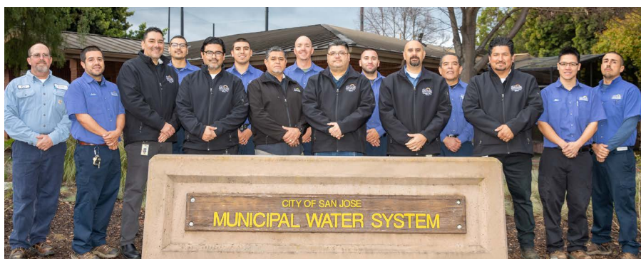
San José Municipal Water System operations and maintenance staff.