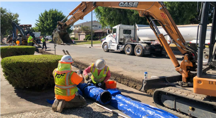
Pipeline replacement projects help ensure the safety and reliability of drinking water for our customers.

Drinking water, including bottled water, may reasonably be expected to contain at least small amounts of some contaminants. The presence of contaminants does not necessarily indicate that water poses a health risk. More information about contaminants and potential health effects can be obtained by calling the EPA's Safe Drinking Water Hotline at 800-426-4791.