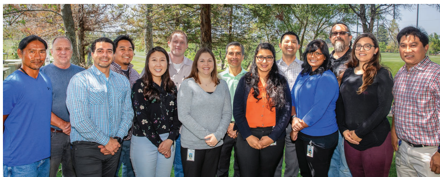
San José Municipal Water System engineering, inspection and water efficiency staff.

For water-efficiency tips or to view the complete list of water use rules in effect at all times, please visit www.sjenvironment.org/waterefficiency or call 408-794-6784 .