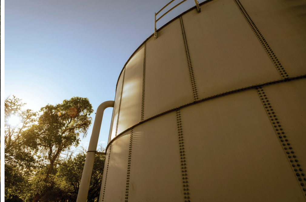
Williams Station wells.