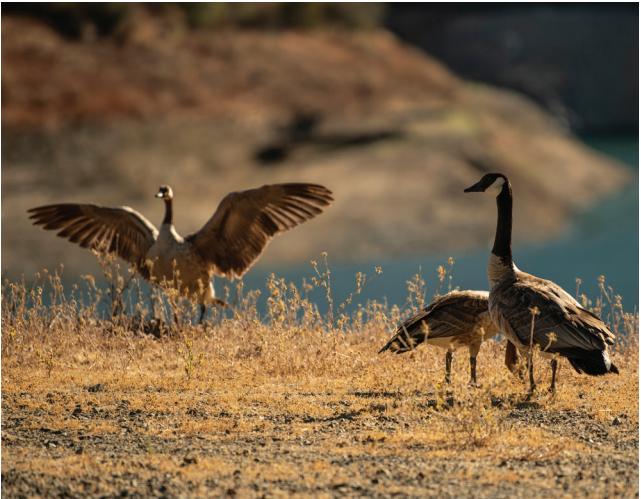
Wildlife rests in the San Jose Water watershed.