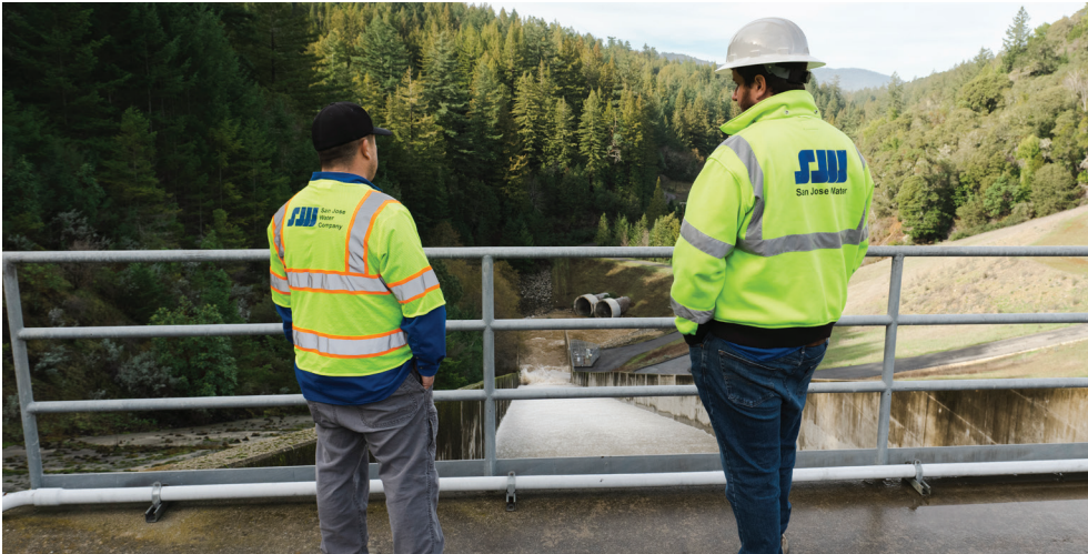
San Jose Water staff survey the Lake Elsman spillway.