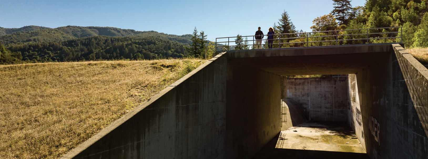
San Jose Water Staff at Austrian Dam.