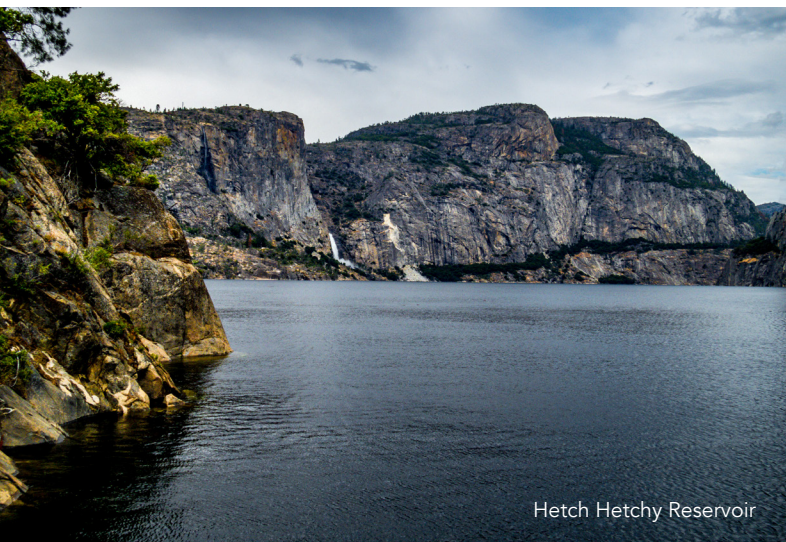
Hetch Hetchy Reservoir

Visit waterboards.ca.gov/drinking_water/certlic/drinkingwater/DWSAP.html for more information, or call (408) 730-7400 to schedule a time to view the City's DWSAP.