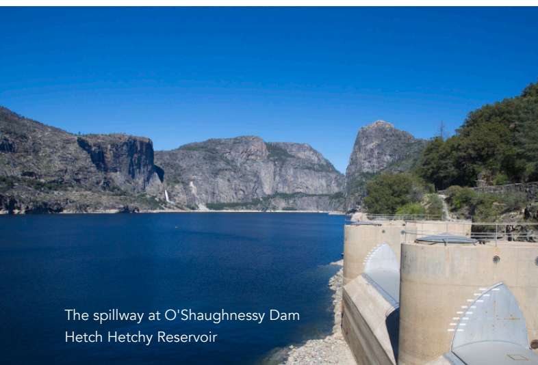
The spillway at O'Shaughnessy Dam Hetch Hetchy Reservoir

Visit waterboards.ca.gov/drinking_water/certlic/drinkingwater/DWSAP.html for more information, or call (408) 730-7400 to schedule a time to view it.