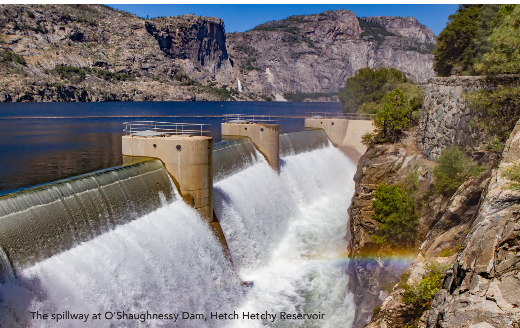
The spillway at O'Shaughnessy Dam, Hetch Hetchy Reservoir

Water Conservation Hotline ► SCVWD (408) 630-2554 valleywater.org