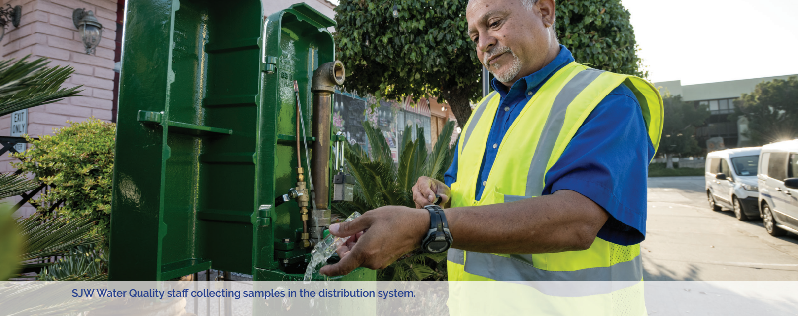
SJW Water Quality staff collecting samples in the distribution system.