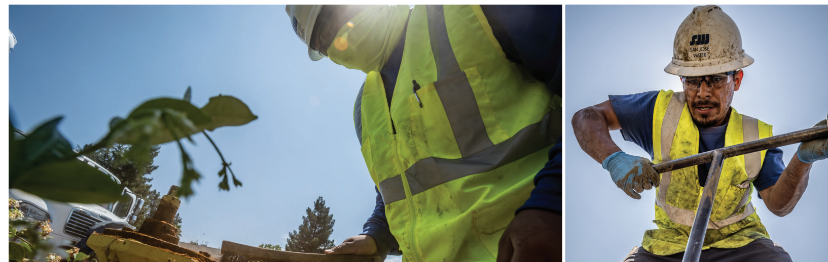
SJW Distribution System Workers repairing hydrants.