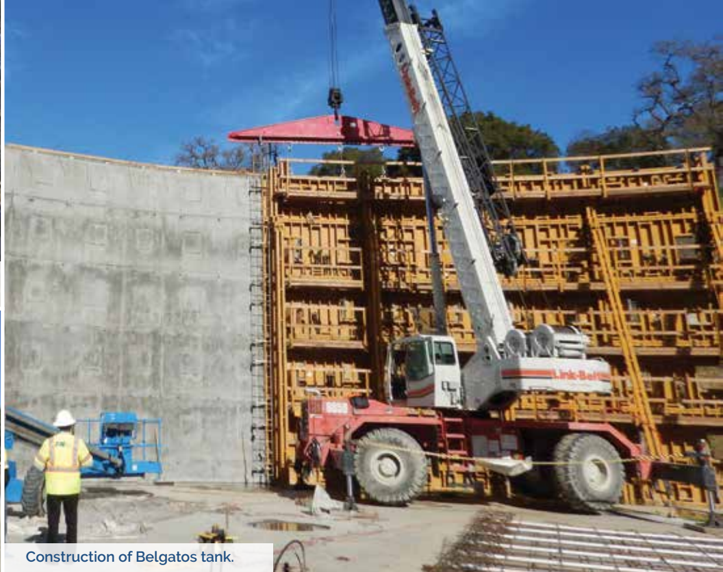
Construction of Belgatos tank.