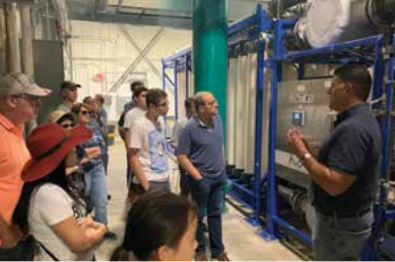
A tour of the award-winning Montevina Water Treatment Plant.