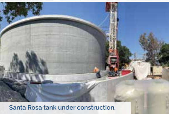
Santa Rosa tank under construction.