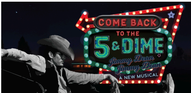
Come Back to the 5 & Dime, Jimmy Dean, Jimmy Dean: A New Musical at MVCPA