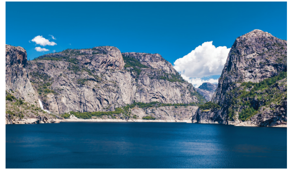
Hetch Hetchy Reservoir

The SFPUC conducts watershed sanitary surveys for its Hetch Hetchy supply annually and local water sources every five years. The latest sanitary surveys for non-Hetch Hetchy watersheds (e.g., Lake Eleanor, Lake Cherry, parts of the Tuolumne River) were completed in 2021 for the period of 2016–2020. These surveys evaluated the sanitary condition, water quality, potential contamination sources, and watershed management activities, and were completed with support from partner agencies, including the National Park Service and U.S. Forest Service. These surveys identified wildlife, livestock, and human activities as potential contamination sources. Prior to distribution, the water meets or exceeds all Federal, State, and County regulations.