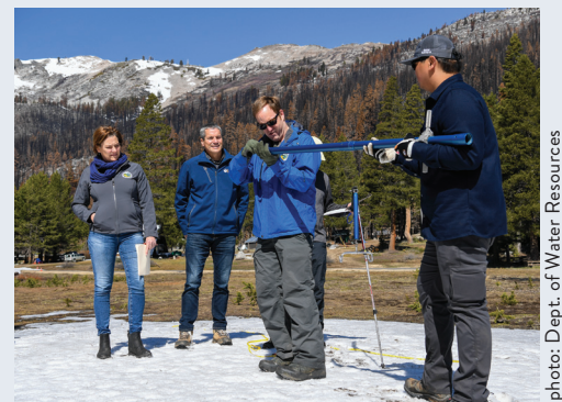
2022 Sierra Nevada Snow Survey Site

The beginning of 2023 started with record-breaking rainfall from multiple winter storms. California faced unprecedented floods after roughly three years of dry conditions. The statewide snowpack for April 2023 was 253 percent of normal. Governor Newsom rescinded the Level 2 water shortage requirement for water agencies. Valley Water, SFPUC, and the City of Mountain View have all rescinded their drought emergencies, with Valley Water maintaining a voluntary call for conservation. For current information, visit MountainView.gov/Drought .