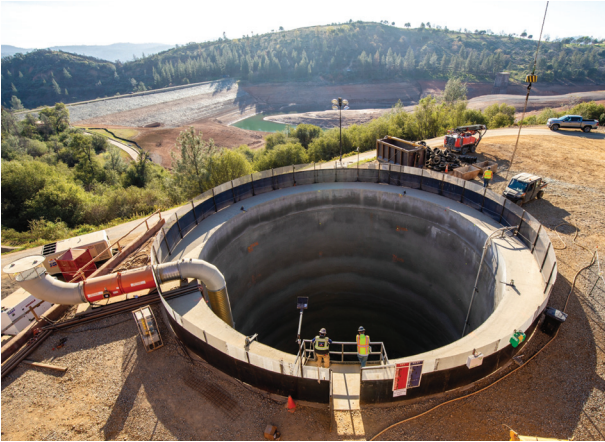
Mountain Tunnel Improvement Project

Climate-driven extremes in weather, such as long-term droughts to prolonged storms, are becoming more frequent with each year. Water managers are tasked with the challenge of protecting community water supplies under varying weather conditions. As the recent drought concludes, managers continue to analyze weather events and water supply conditions to identify opportunities to increase water storage, improve infrastructure, and safeguard water resources. This section includes the latest water supply projects that Mountain View and its water wholesalers are working on to ensure your drinking water is protected through various climate events.