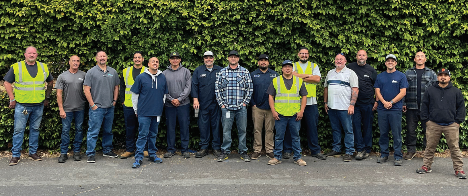
City of Mountain View Water Operations and Distribution Staff