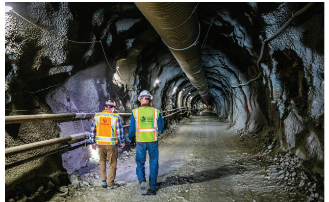
Mountain Tunnel Improvement Project

SFPUC is in its second year of construction for the Mountain Tunnel Improvement Project. The 19-mile-long water tunnel transmits drinking water from Hetch Hetchy Reservoir to 2.7 million customers in the greater San Francisco Bay Area. Improvements to the Mountain Tunnel include material repairs to interior and exterior piping and construction of new tunnel segments and control valves to increase operational reliability. Additional SFPUC projects are part of the larger, multi-year Hetchy Capital Improvement Program to improve water storage and reliability throughout the Hetch Hetchy Regional Water System.