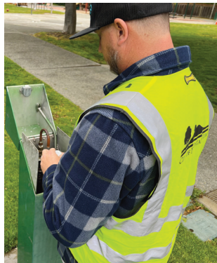
City Staff Collecting a Water Sample

LEAD: To comply with State and Federal regulations, the City conducts lead testing every three years. Water samples are tested from representative homes throughout the City and the results are published on Page 5 of this report. Lead in drinking water comes primarily from materials and components associated with water service lines and home plumbing. If present in your household water, elevated levels of lead can cause serious health problems, especially for pregnant women and young children. The City of Mountain View is responsible for providing high-quality drinking water in its distribution system but does not control the variety of materials used in private plumbing components. If you are concerned about lead in your water, you may wish to have your water tested independently and flush your tap for 30 seconds to 2 minutes after long periods of nonuse. Testing can be performed using an over-the-counter lead testing kit, commonly available at local hardware stores or through a certified drinking water laboratory. Additional information on lead in drinking water, testing methods, and steps you can take to minimize exposure is available from the Safe Drinking Water Hotline or at EPA.gov/lead .