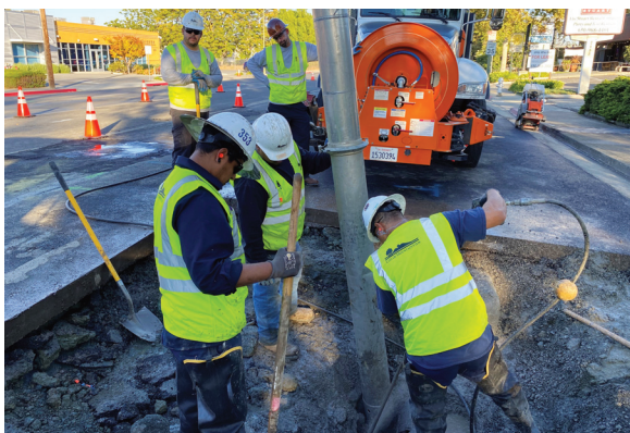
Water Main Repair by Mountain View Staff