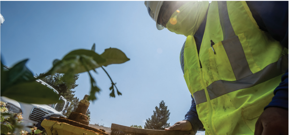
SJW Distribution System Workers repairing hydrants.