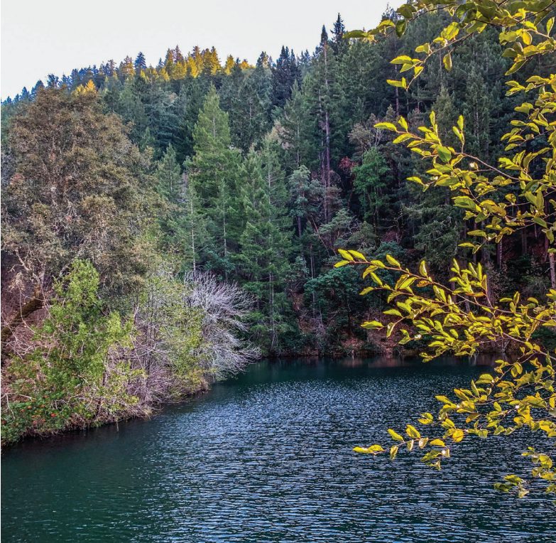
Lake Williams in the Los Gatos Watershed.