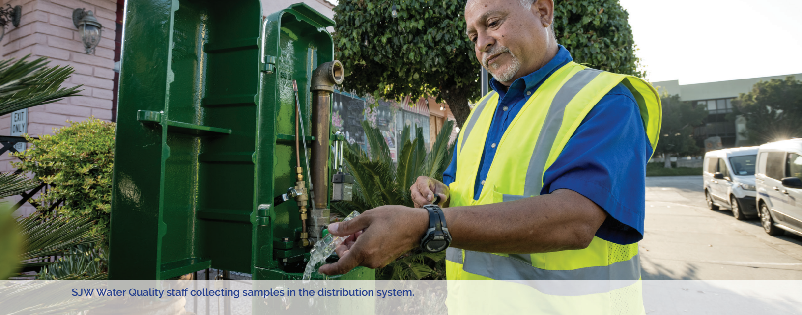
SJW Water Quality staff collecting samples in the distribution system.