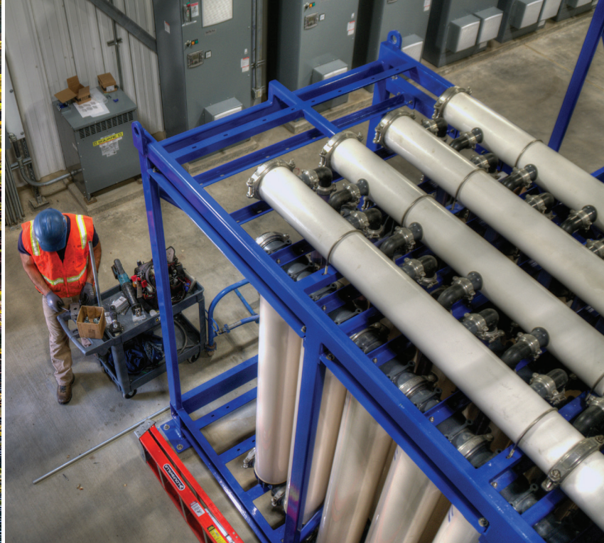
Ultrafiltration modules, like the one shown above, remove parasites, bacteria, and viruses from the water.