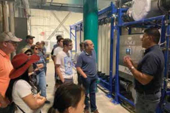
A tour of the award-winning Montevina Water Treatment Plant.