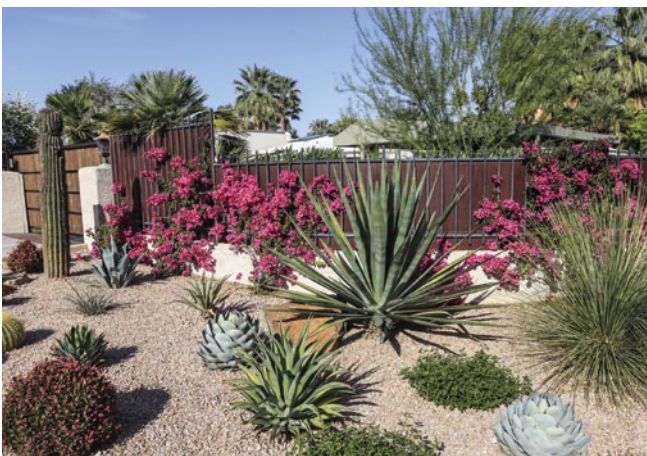
A drought-tolerant garden.