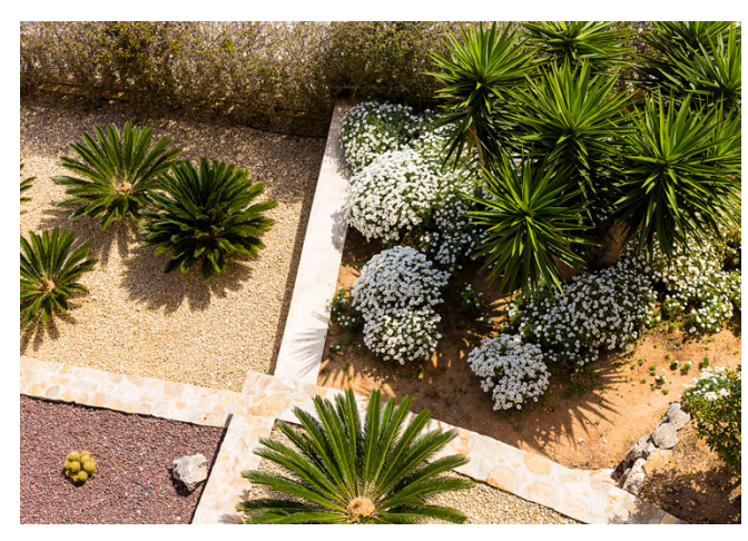
A drought-tolerant garden.