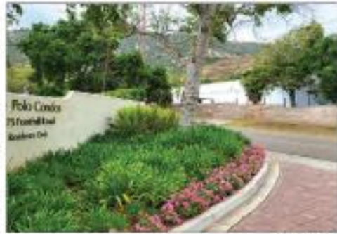
The Polo Condos homeowners' association, representing 139 condominiums next to the Santa Barbara Polo & Racquet Club at the western edge of the valley, filed an appeal of Island Breeze Farms' approval last year.

Robertson and others noted that in addition to Island Breeze, cannabis greenhouses without scrubbers near the Polo Condos included G&S Flowers and K&B Flowers, eight acres at 3041 Foothill, and Green Valley and Ocean Hill Farms, 10 acres at 3613 Foothill. Santa Verde Farms, approved for 10 acres, is at 3603 Via Real, just south of the Polo Condos. It is not yet in operation.