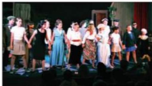
The cast of "No Body to Murder" takes a bow before the curtains close during 2017's Drama Camp.