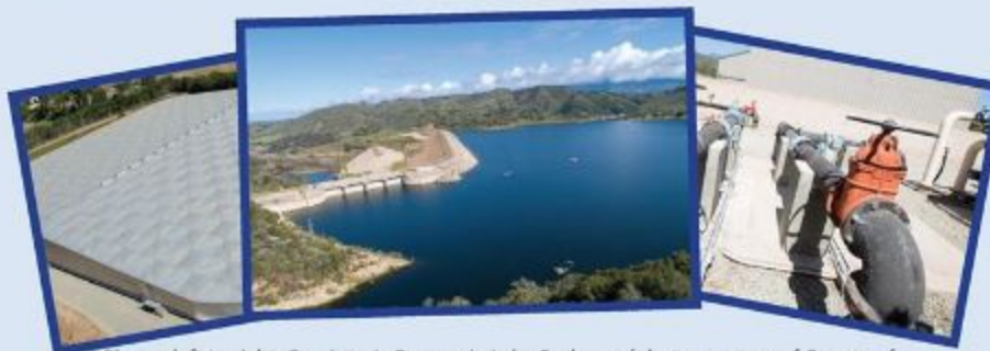
Photos left to right, Carpinteria Reservoir, Lake Cachuma, and El Carro Well site.

A paper copy can be printed directly from the above noted web page or by contacting the District at (805) 684-2816 or info@cvwd.net .