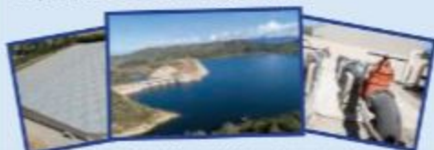
Photos (left to right): Carpinteria Reservoir, Lake Cachuma, and El Cerrito Water side.

A paper copy can be printed directly from the above noted web page or by contacting the District at (805) 684-2816 or info@cvwd.net .