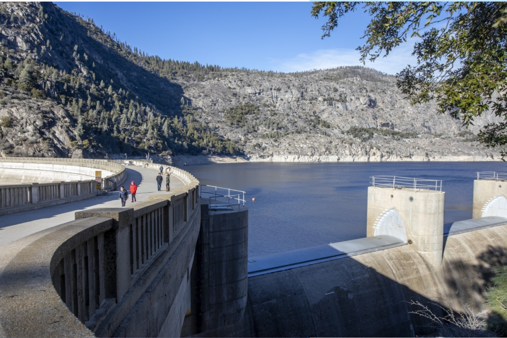
Pictured above: Hetch Hetchy Reservoir