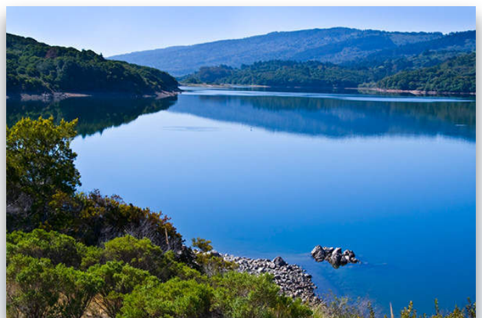
Crystal Springs Reservoir, San Bruno

protected and carefully managed by the San Francisco Public Utilities Commission (SFPUC). These sources are diverse in both the origin and the location with the surface water stored in reservoirs located in the Sierra Nevada, Alameda County and San Mateo County, and groundwater stored in a deep aquifer located in the northern part of San Mateo County.