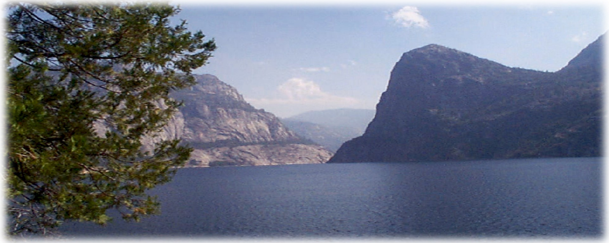
Hetch Hetchy Reservoir