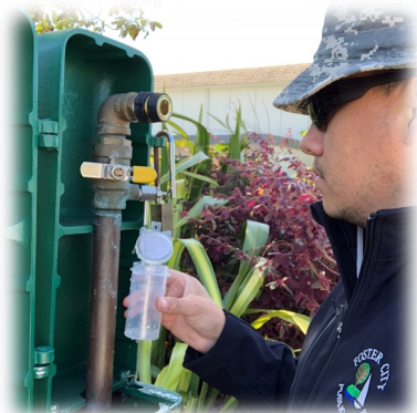
EMID Water Quality Testing

Generally, the sources of drinking water (both tap water and bottled water) include rivers, lakes, oceans, streams, ponds, reservoirs, springs and wells. As water travels over the surface of the land or through the ground, it dissolves naturally occurring minerals and, in some cases, radioactive material, and can pick up substances resulting from the presence of animals or from human activity. Such substances are called contaminants, and may be present in source water as: