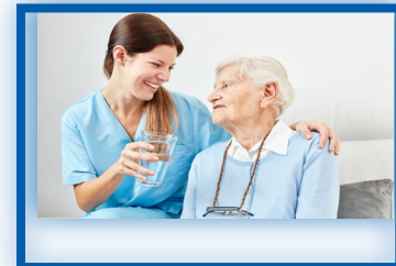
Daly City staff at work for the community

Special Health Needs. Drinking water, including bottled water, may reasonably be expected to contain at least small amounts of some contaminants. The presence of contaminants does not necessarily indicate that water poses a health risk. Some people may be more vulnerable to contaminants in drinking water than the general population. Immuno-compromised persons, such as those with cancer undergoing chemotherapy, persons who have undergone organ transplants, people with HIV/AIDS or other immune system disorders, some elderly people, and infants can be particularly at risk from infections. These people should seek advice about drinking water from their health care providers. USEPA/ Centers for Disease Control guidelines on appropriate means to lessen the risk of infection by Cryptosporidium and other microbial contaminants are available from the Safe Drinking Water Hotline at 800-426-4791 or at www.epa.gov/safewater .