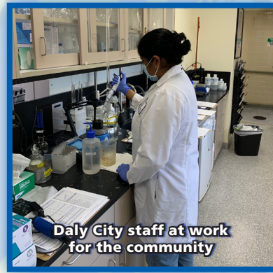
Daly City staff at work for the community

In March, 2003, a drinking water source assessment was completed. The assessment showed that five of Daly City's six municipal production wells assessed as being highly protected from potential pathways of contamination. Well #4's assessment showed it as being moderately protected. With the activation of the new Sullivan well in 2015, Well #4 has been designated as an emergency standby well. Daly City's municipal wells are considered most vulnerable to automotive repair activities, roadway contaminants, and railways. A copy of the complete assessment is available from the State Water Resources Control Board, Division of Drinking Water, 850 Marina Bay Parkway, Building P, 2nd Floor, Richmond, CA 94804. You may also obtain a summary of the assessment by contacting either State Board District Engineer Eric Lacy at (510) 620-3453, or Daly City's Water and Wastewater Resources Department at (650) 991-8200.