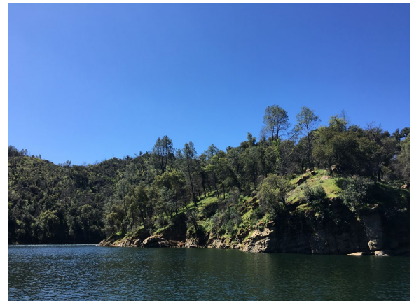
Nacimiento Reservoir at 86% capacity April 2019

A watershed sanitary survey was initially conducted in 2011. Updates were conducted in 2015 and 2020. The survey identifies potential contaminating activities in the watershed and assesses their impact on the raw and treated water quality. The greatest risks to the Nacimiento Reservoir as a drinking water supply come from extensive grazing, unlimited body contact recreation, numerous domestic wastewater facilities, and the potential for a large wildland fire. Urban development and agricultural cropland are increasing and may present future risks. Variable risk levels are presented by military activities and illicit commercial crops.