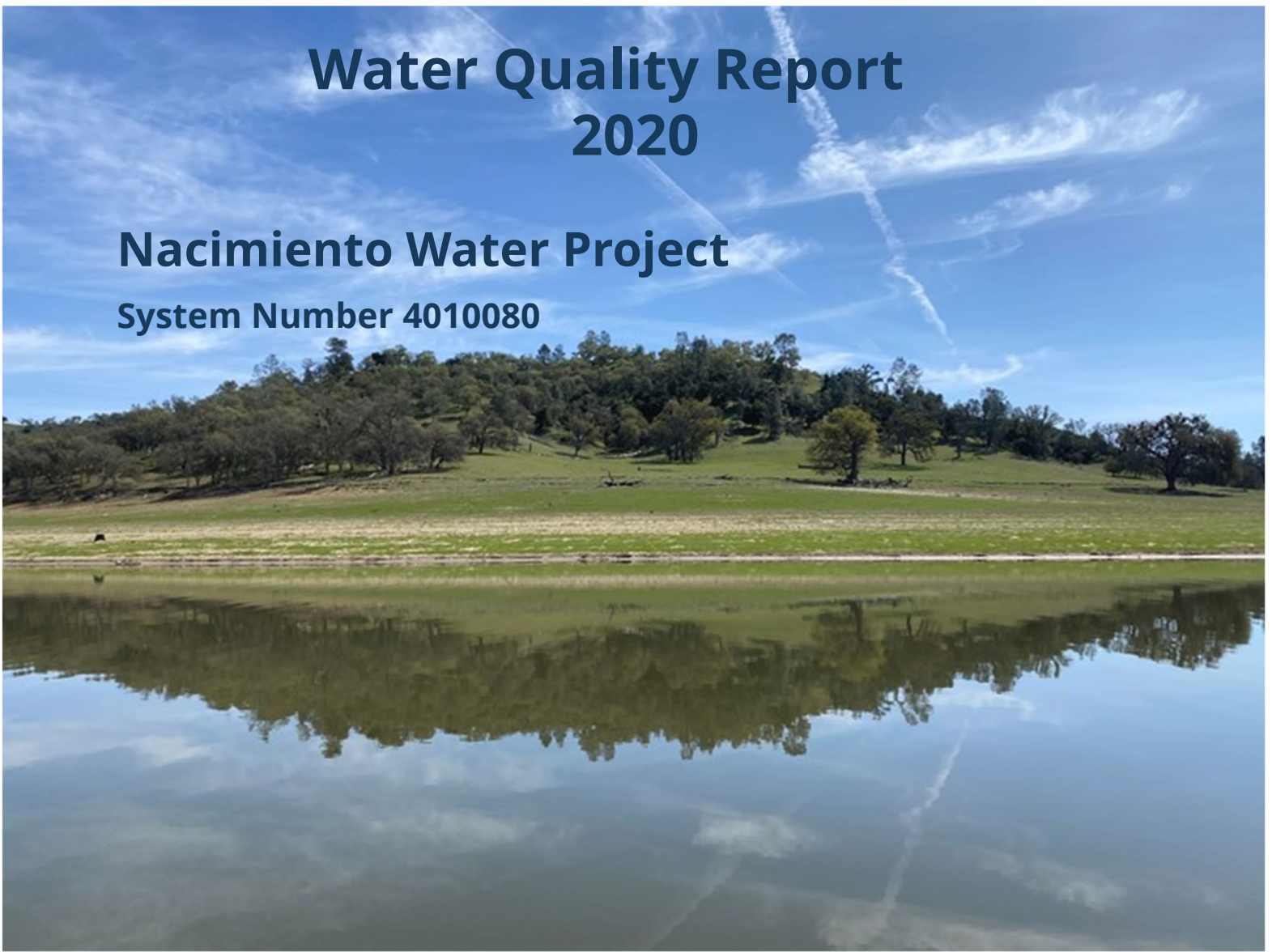
Nacimiento Reservoir at 41% capacity March 2021

Public Works will be a valued community partner enhancing quality of life for our fellow county residents.