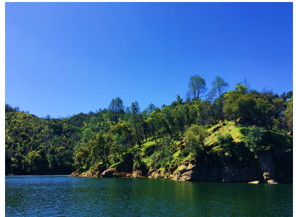
Nacimiento Reservoir at 86% capacity April 2019

A watershed sanitary survey was initially conducted in 2011 and updated in 2015. The survey identifies potential contaminating activities in the watershed and assesses their impact on the raw and treated water quality. The greatest risks to the Nacimiento Reservoir as a drinking water supply come from extensive grazing, unlimited body contact recreation, numerous domestic wastewater facilities, and the potential for a large wildland fire. Urban development and agricultural cropland are increasing and may present future risks. Variable risk levels are presented by military activities and illicit commercial crops.