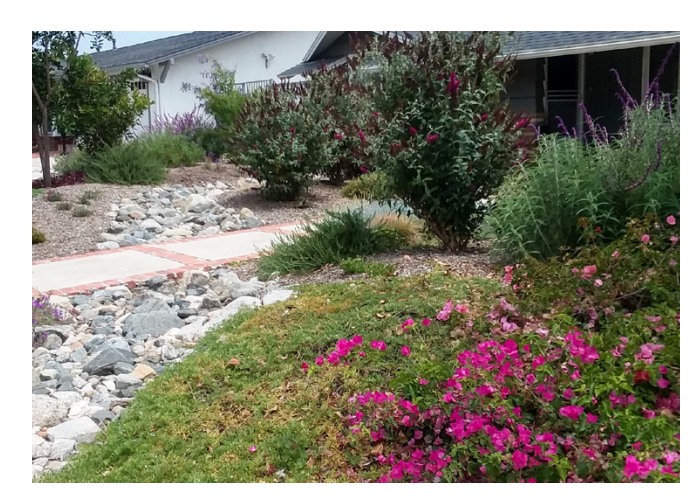
A drought-tolerant garden.