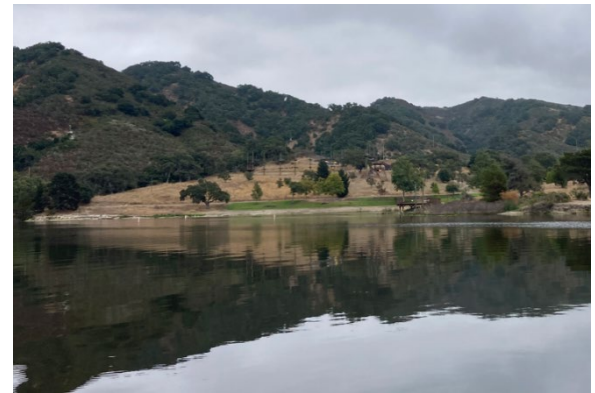
Full Lopez Lake after winter storms (Swim area)

Source water for the Lopez Project comes from Lopez Lake, located approximately 10 miles east of Arroyo Grande. The lake is part of a 67-square-mile watershed and has a storage capacity of 49,200 acre-feet, or about 16 billion gallons of water. The water is conveyed 3 miles by pipeline to the Lopez Terminal Reservoir adjacent to the Lopez Water Treatment Plant (WTP). The water is held in the Terminal for over a month before entering the WTP. During that time, particles settle out of the water, and exposure to sunlight helps reduce the risk of bacterial and viral contamination from human contact in Lopez Lake.