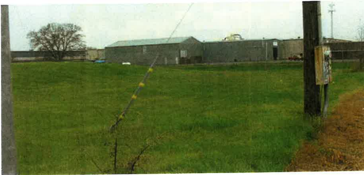
Plant and Property - South side