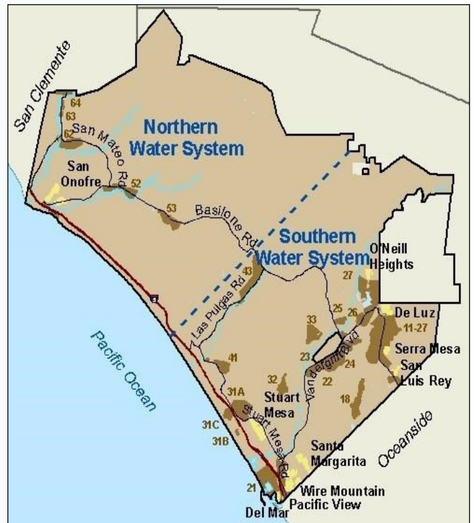
Camp Pendleton Water Service Areas

Southern Water System: Services the 43 Area and all areas south and southeast of Las Pulgas Road. Wells located in the Las Pulgas and Santa Margarita River basins supply water to this water system.