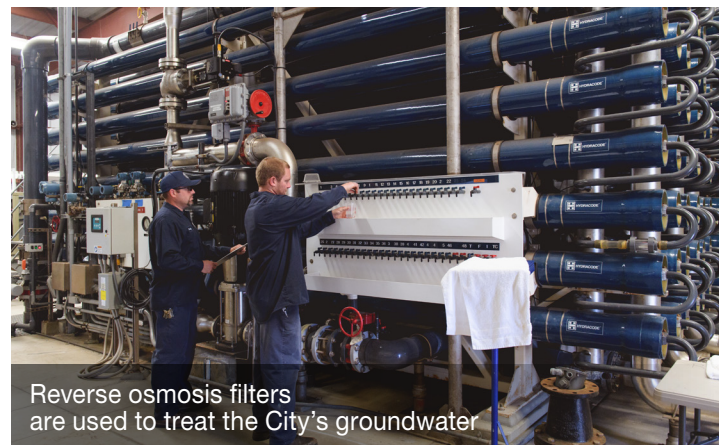
Reverse osmosis filters are used to treat the City's groundwater