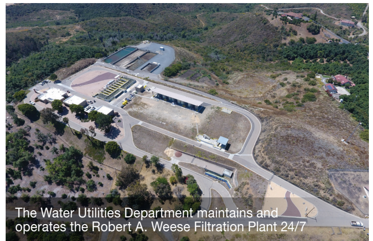
The Water Utilities Department maintains and operates the Robert A. Weese Filtration Plant 24/7