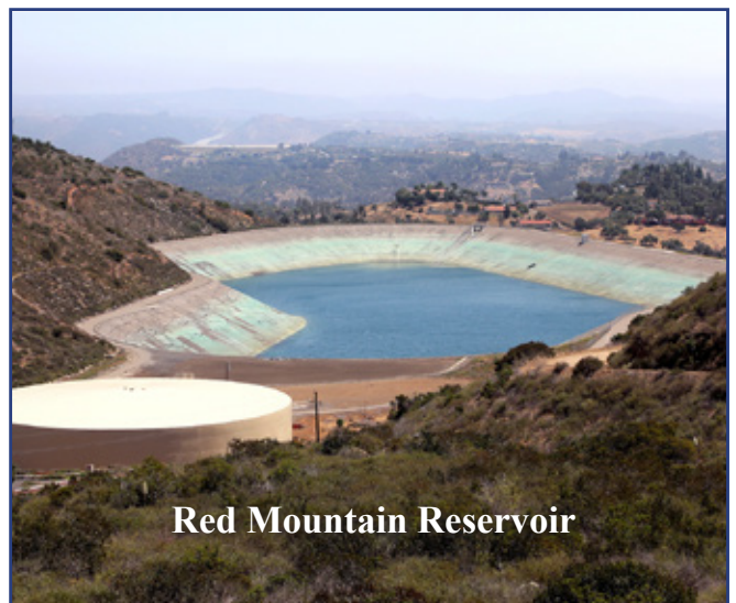
Red Mountain Reservoir

💧 The water the District purchases from the Water Authority is a blend of fully-treated Colorado River and State Water Project water that receives complete conventional treatment, along with ozone treatment, which is a cutting-edge, high-quality disinfection process. The water is treated at Metropolitan Water District's Skinner Filtration Plant. The water delivered to Red Mountain has a chloramine (mixture of chlorine and ammonia) disinfectant residual.