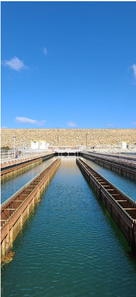
Escondido-Vista Water Treatment Plant.