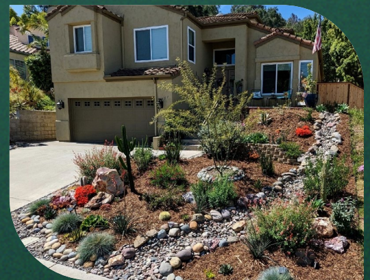
Escondido 2023 Landscape Contest Winner - "After"