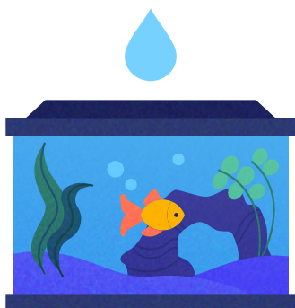
Milligrams Per Liter: (mg/L) Parts per million (ppm) One drop in a 10-gallon aquarium