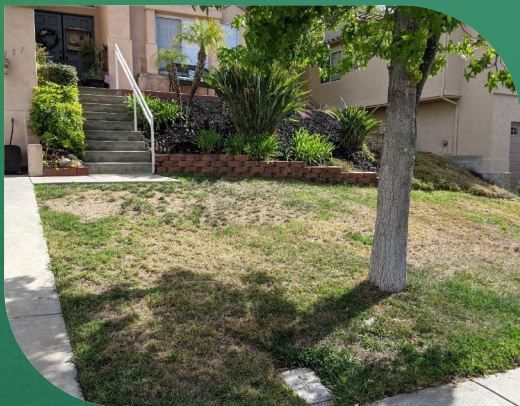
Escondido 2023 Landscape Contest Winner - "Before"

Geosmin is a non-harmful, naturally occurring compound produced by bacteria in soil and algae found in surface water. Geosmin is common throughout the United States; in southern California, it is most noticeable during warmer months and when the City of Escondido's water supply is sourced from open surface reservoirs. Geosmin typically produces an earthy or musty odor similar to the odor of damp soil and is detectable by many people at concentrations of 5 to 10 parts per trillion (that's five to ten drops in 16 Olympic size pools). Chilling water, adding ice cubes, a slice of lemon or cucumber, or a few drops of lemon juice will improve the taste and odor.