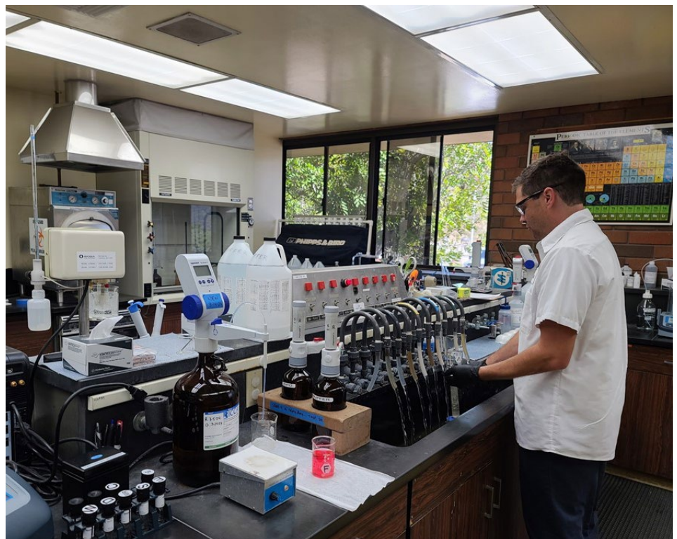
Water Treatment Plant operator sampling.

More information about contaminants and potential health effects can be obtained by visiting the U.S. Environmental Protection Agency's (USEPA) website at: epa.gov/ground-water-and-drinking-water