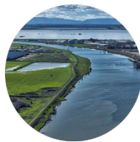
1 Bay Delta Imported Water Source