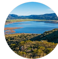
3 Lake Henshaw Local Water Source