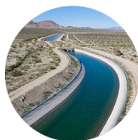
2 Colorado River Aqueduct Imported Water Source