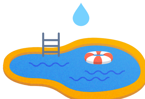
Micrograms Per Liter: (µg/L) Parts per billion (ppb) One drop in a residential swimming pool

Contaminant Candidate List (CCL): The Contaminant Candidate List (CCL) is a list of contaminants that are currently not subject to any proposed or promulgated national primary drinking water regulations, but are known or anticipated to occur in public water systems. Contaminants listed on the CCL may require future regulation under the Safe Drinking Water Act.