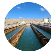
4 City of Escondido Water System Lake Wohlford, Dixon Lake, Water Distribution System, Escondido-Vista Water Treatment Plant