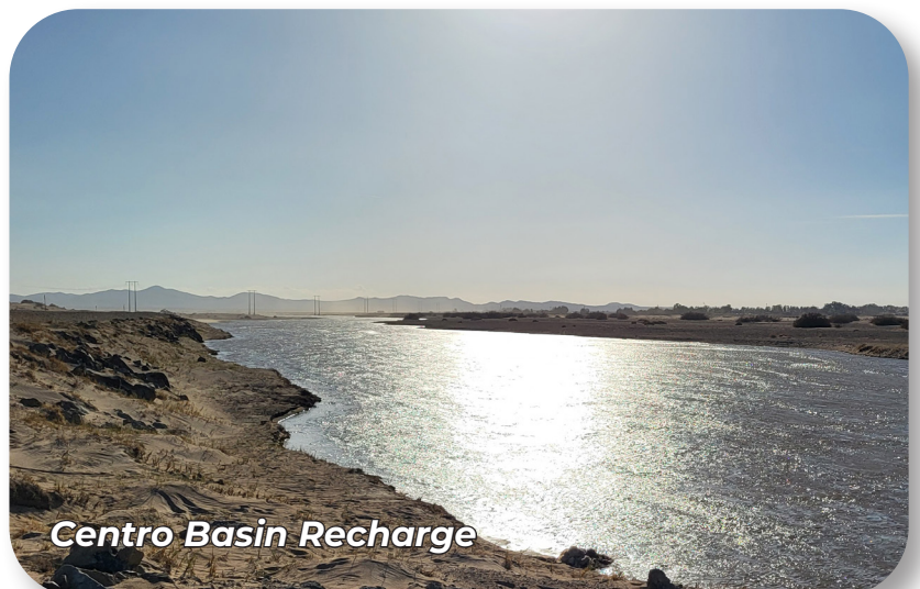
Centro Basin Recharge

The Mojave Water Agency is a water wholesaler and does not provide water service to retail customers. As a result, the lead service line inventory is not applicable. Additional information on lead in drinking water is available at https://www.epa.gov/safewater/lead .