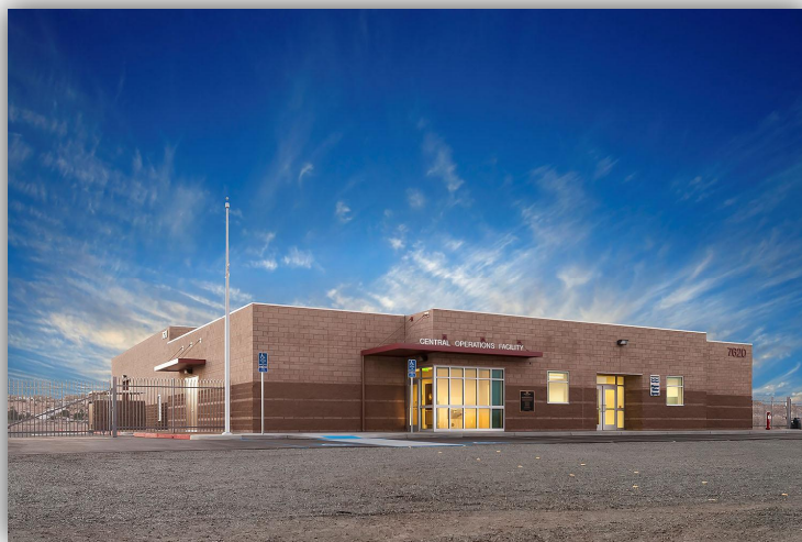
MWA Operations Center, Apple Valley

MWA replenishes the local groundwater supply with State Water Project (SWP) water, which is transported from the California Aqueduct through a series of pipelines to the Deep Creek recharge site, the Agency's largest groundwater recharge facility, where it is released into nearby groundwater recharge areas to percolate into the underground aquifer. The water is later recovered, pumped, and distributed by retail water purveyors to serve local communities.