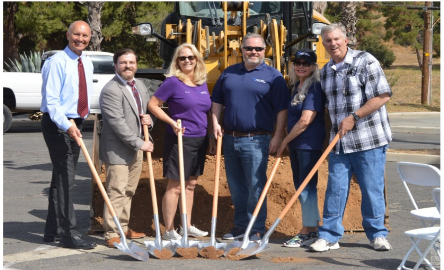
The Board of Directors and General Manager of the Yucaipa Valley Water District celebrating the groundbreaking of the Calimesa Recycled Water Pipeline Project.