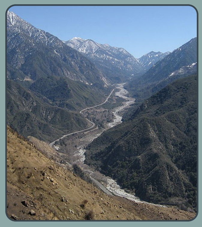
Pictured: Mill Creek, looking northeast from Morton Peak. Mill Creek provides approximately 25% of the Clty's water supply.

The City of Redlands water system is supported by groundwater and surface water sources. Surface water sources include the Santa Ana River Watershed, Mill Creek Watershed and California State Water Project. Approximately 50% of the of the drinking water produced is treated surface water delivered by the Horace P. Hinckley and Henry Tate conventional surface water treatment plants. The remaining 50% is produced by 23 local groundwater wells located within the Bunker Hill Groundwater Basin.