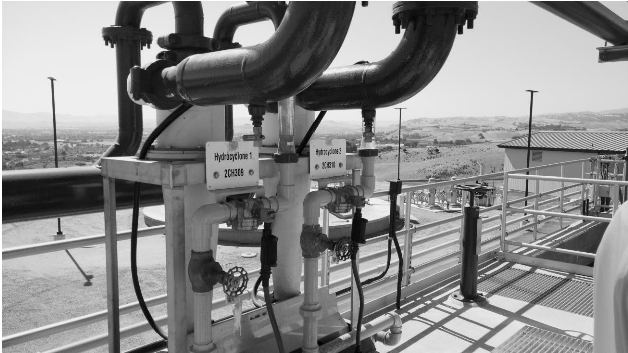
West Hills Surface Water Treatment Plant