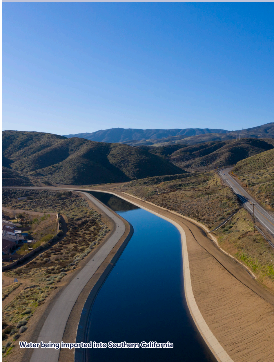
Water being imported into Southern California

Testing has confirmed that Western Water's drinking water, most of which is imported from Northern California snowmelt, is safe and does not contain PFAS above state-mandated notification levels. Learn more about these forever chemicals at WesternWaterCA.gov/PFAS .