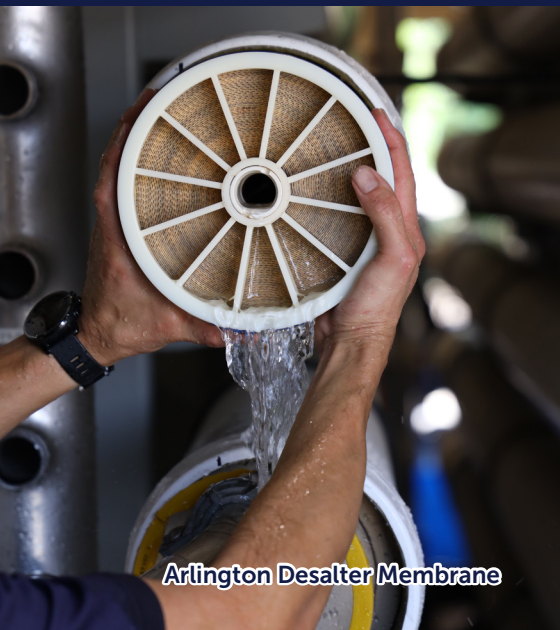
Arlington Desalter Membrane