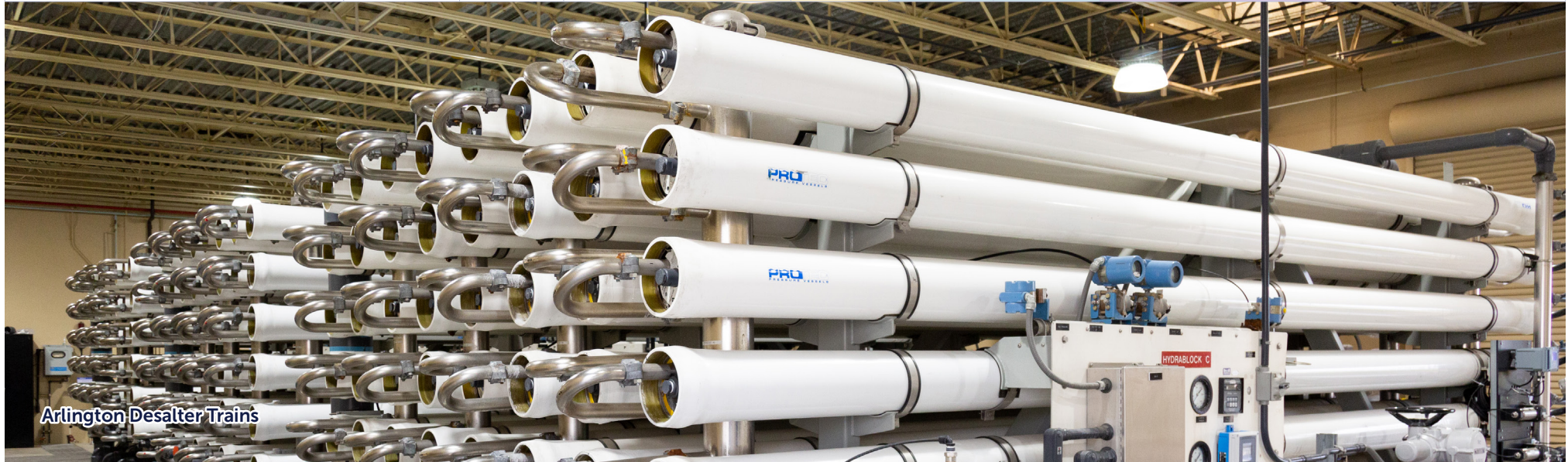
Arlington Desalter Trains