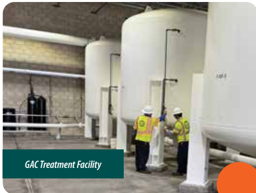
GAC Treatment Facility

While your drinking water meets the federal and state standard for arsenic, it does contain low levels of arsenic. The arsenic standard balances the current understanding of arsenic's possible health effects against the costs of removing arsenic from drinking water. The U.S. Environmental Protection Agency continues to research the health effects of