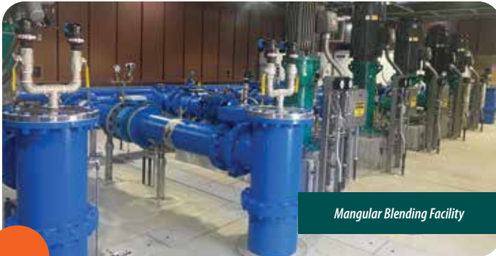
Mangular Blending Facility

The UD has five blending facilities that blend treated groundwater sources with raw groundwater sources and treated surface water to deliver safe, reliable drinking water to your tap. You will notice in the tables of detected contaminants that the groundwater exceeded the primary standard for fluoride, nitrate and perchlorate. The UD is required by law to report the range of all raw groundwater samples monitored, as well as the average concentration delivered to your tap. The averages of what you receive at your tap are much lower because the UD treats and blends water from several sources to improve water quality. The blending stations are continuously monitored and routinely sampled to ensure that the water delivered to your tap meets all health standards