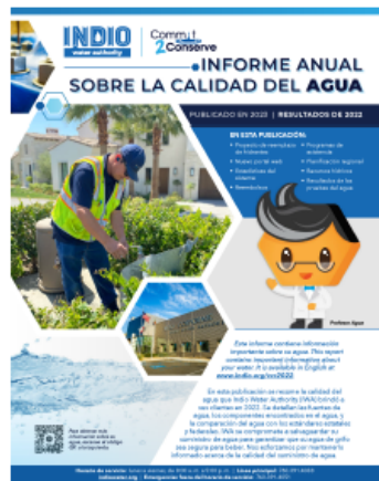
2022 Informe Anual Sobre La Calidad Del Agua (Español)