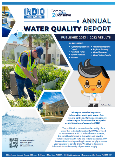
2022 Water Quality Report (English)

The most recent report is the 2022 annual water quality report. You can access the report by clicking on the links below.