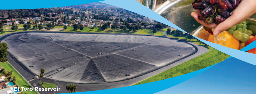
El Toro Reservoir