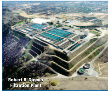
Robert B. Diemer Filtration Plant

Your drinking water consists of imported treated surface water from MWDSC, as well as treated surface water from IRWD's Baker Water Treatment Plant (BWTP), which treats surface water from both MWDSC and from the Santiago Reservoir (Irvine Lake). MWDSC's imported water sources are the Colorado River and the State Water Project, which draws water from the Sacramento-San Joaquin River Delta.