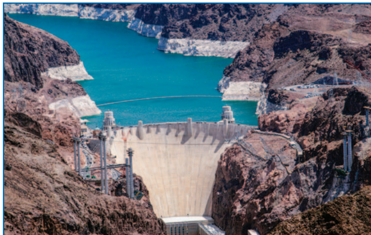
Hoover Dam, on the Colorado River (Lake Mead behind it).

In some cases, ETWD goes beyond what is required by