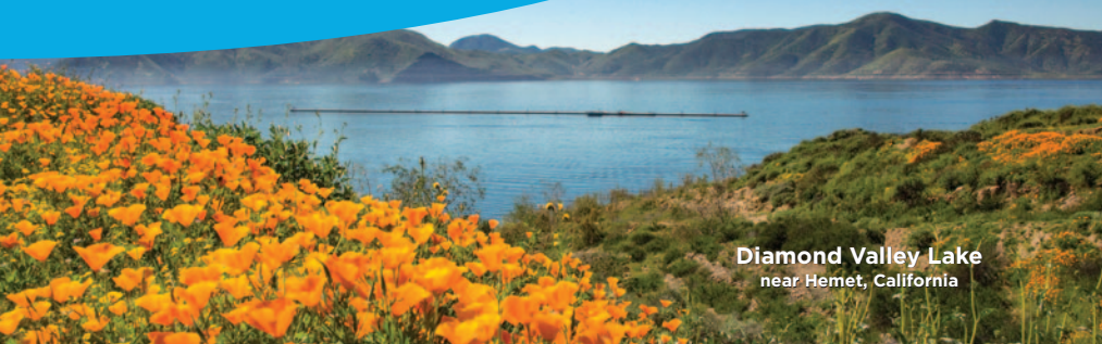
Diamond Valley Lake near Hemet, California