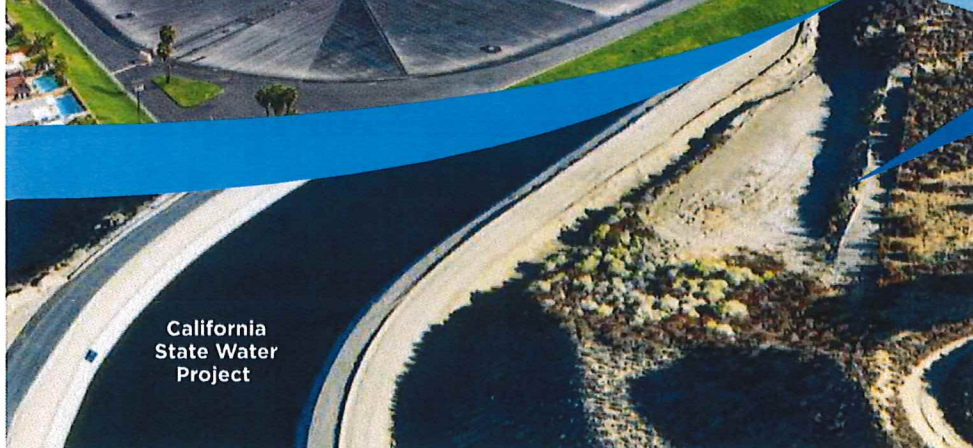
California State Water Project