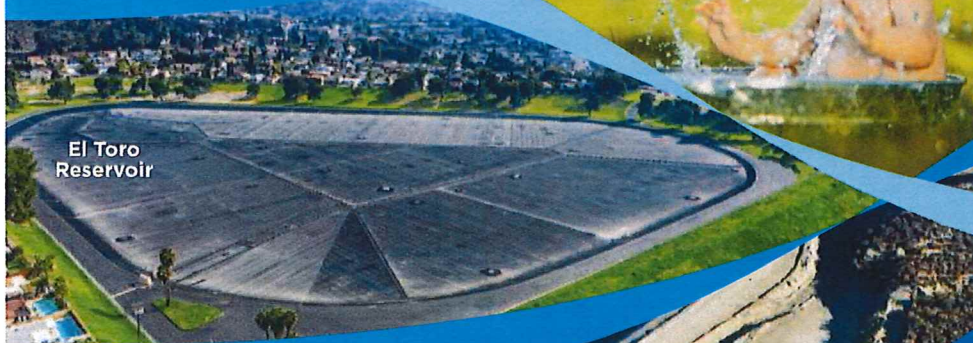
El Toro Reservoir