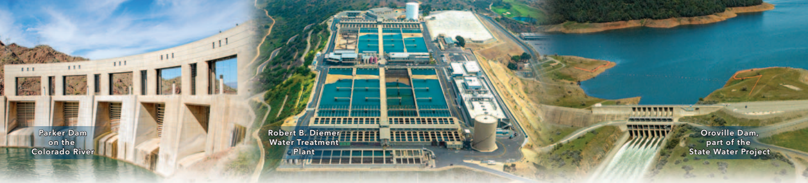
Parker Dam on the Colorado River