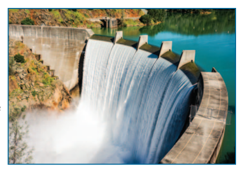
Englebright Dam on the Yuba River

is replenished with water from the Santa Ana River, local rainfall, recycled Groundwater Replenishment System (GWRS) water, and imported water. The groundwater basin is 350 square miles and lies beneath north and central Orange County from Irvine to the Los Angeles County border and from Yorba Linda to the Pacific Ocean. More than 20 cities and retail water districts draw from the basin to provide water to homes and businesses. In 2021, the City only provided groundwater, which is reflected in the charts provided.