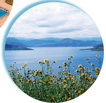
Diamond Valley Lake