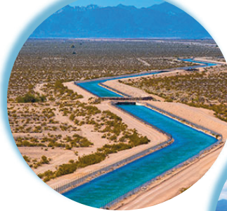
Colorado River Aqueduct