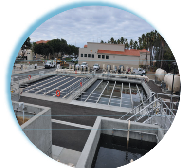
Water Reclamation Plant

The City's water reclamation plant treats wastewater while also producing recycled water for irrigation. It delivers approximately 1,400 acre feet of recycled water per year for irrigation to 53 sites in the City that might otherwise rely on potable water. These customers are primarily homeowner associations and business parks, city parks, schools and traffic medians. Recycled water provides a new source of supply and reduces the City's reliability on imported water from the Metropolitan Water District.