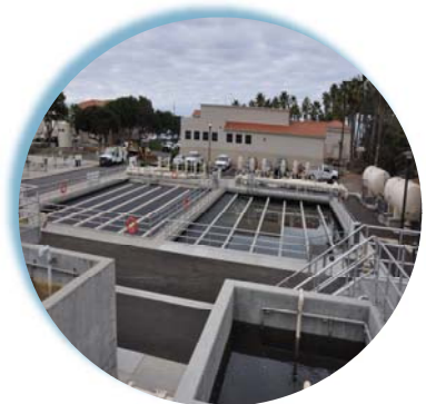
Water Reclamation Plant

The City's water reclamation plant treats wastewater while also producing recycled water for irrigation. It delivers approximately 1,400 acre feet of recycled water per year for irrigation to 53 sites in the City that might otherwise rely on potable water. These customers are primarily homeowner associations and business parks, city parks, schools and traffic medians. Recycled water provides a new source of supply and reduces the City's reliability on imported water from the Metropolitan Water District.