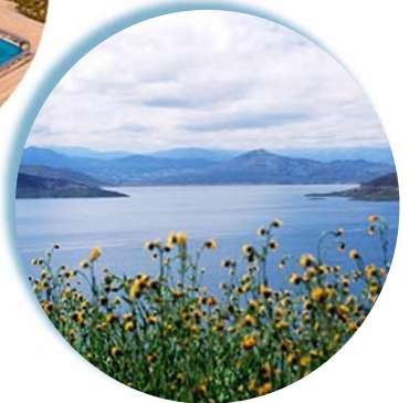
Diamond Valley Lake