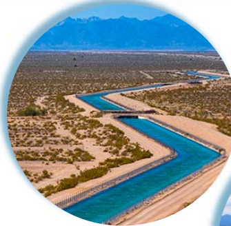
Colorado River Aqueduct